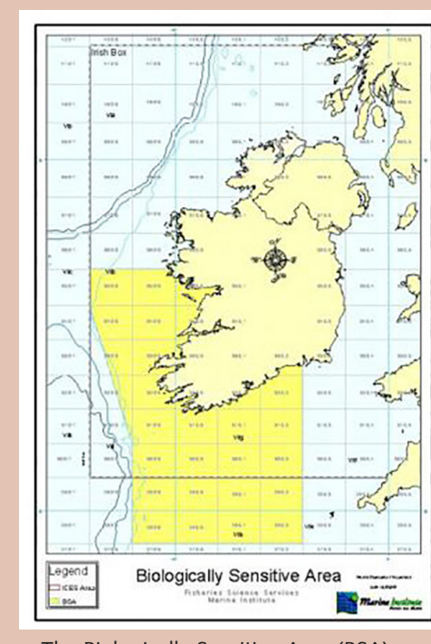
The Biologically Sensitive Area (BSA).

be a substantial time lag particularly where paper-based log sheets are the system being used as happens in the BSA. The Verifish company, which has developed an electronic system of data recording, used primarily for the purposes of certification, has made a system available to the fishermen in the BSA to record their trips daily which would provide the necessary data to manage their available KwDays month-by-month. There is a small fee to avail of this system but negligible compared to the loss of fishing opportunity if this fishery should close again in late autumn 2019.